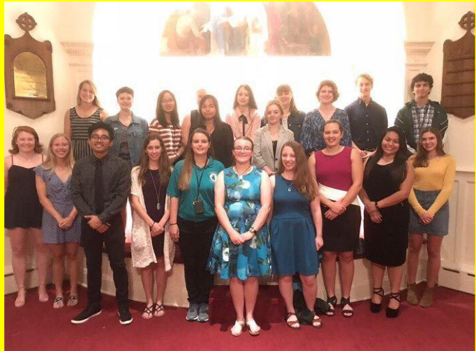
21 students pledge into Alpha Phi Omega as part of the Alpha Lambda pledge class.

The current brothers of Alpha Epsilon Lambda sponsored 21 new pledges into the chapter on Sept. 23. Since then pledges have taken steps to become official brothers of Alpha Phi Omega through a variety of service and fellowship events as well as attending a weekly pledge class.