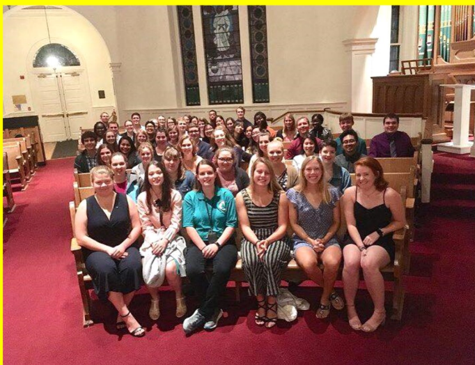
Current brothers and Pledges join for a group photo post Pledge Ceremony.